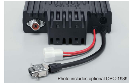
Photo includes optional OPC-1939

With the optional OPC-1939 D-SUB 15-pin ACC cable, the IC-F5021 series can be programmed to control an operating channel from an external device (up to 16 preprogrammed channels). The ACC connector also provides an ignition sensing function, external PTT, PC command, horn honk, audio output and modulated signal input depending on programming.